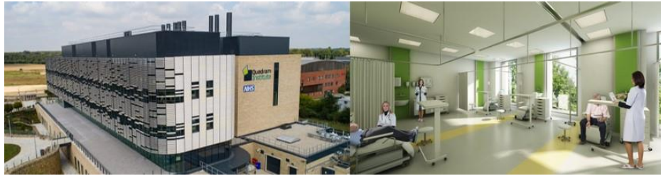
Quadram Institute and Clinical Research Facility

appointment to meet you at the Quadram Institute Clinical Research Facility (QI CRF) at a time that is convenient to you. The QI CRF is an NHS facility of the Norfolk and Norwich University Hospital (NNUH).