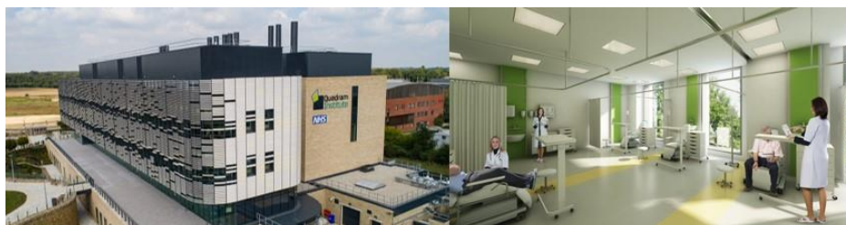
Quadram Institute and Clinical Research Facility

To take part in this study, we first need you to sign a consent form. You can do this by speaking to a member of the research team by video/telephone call (we are happy to use your preference of platform e.g. a call with video, without video, phone, Teams, Zoom, etc.); or we can make an appointment to meet you at the Quadram Institute Clinical Research Facility (QI CRF) at a time that is convenient to you. The QI CRF is an NHS facility of the Norfolk and Norwich University Hospital (NNUH).